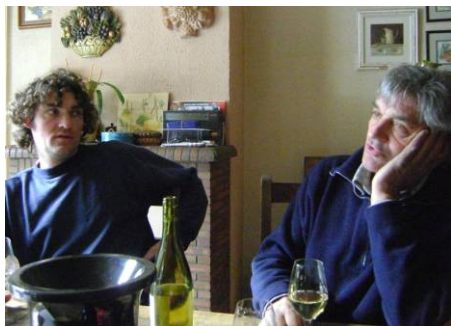
Musing on Jasnières before lunch