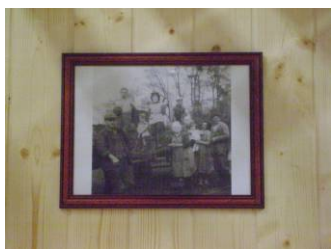
Family portrait from c. 1960

Along a river full of vinous oddities, Cheverny and Cour-Cheverny are so off the beaten track that they might as well be mainstream. Like much of the eastern Touraine, the two appellations are a patchwork of clay and sand-dominated parcels, with hints of silica (silex) and chalk peeking through, especially in the heart of the region. Cheverny is largely planted to the same varieties as the rest of Touraine (Sauvignon and Chardonnay, Gamay, Pinot Noir, Cabernets Franc and Sauvignon, and handfuls of Pineau d'Aunis), but its brethren Cour-Cheverny is the last bastion of Romorantin, a late-ripening, powerful grape which used to be more common. Romorantin is a finicky grape to work with