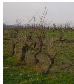
Happy bush vines

“I want my vines to feel free and happy – I think it leads to more joyful wines,” Evelyne said as we discussed a tiny patch of bush vines. Chenin Blanc is most typically trained along wires as it is easier to manage vine growth during the all-important summer, when the plant channels its energy into producing shoots and leaves. Evelyne was however experimenting with letting some vines grow unassisted, close to the ground, curious to see what the effects were on the grapes and wine. That she chose old vines in her top vineyard for the trial speaks to her commitment to make the best possible wines; that she couldn’t resist cracking a half-joke speaks to her unbridled enthusiasm for life and wine.