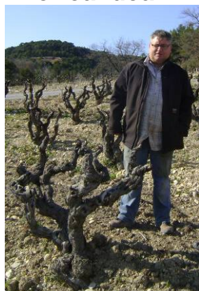
Helen likes his vines short

Vines are traditionally pruned close to the ground in the Southern Rhône to protect them against the fierce northerly wind known as the Mistral, which can exceed speeds of 100km/h. However, this method of vine training requires both skill and dedication, and makes machine harvesting complicated, so the trend in the region has been to train the vines on wire, especially at the larger estates.